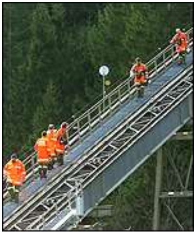
Rescue teams clamber towards the scene of the disaster

At least 33 of the dead are believed to have been local government employees and their families from the Austrian town of Wels, who were on an office outing.